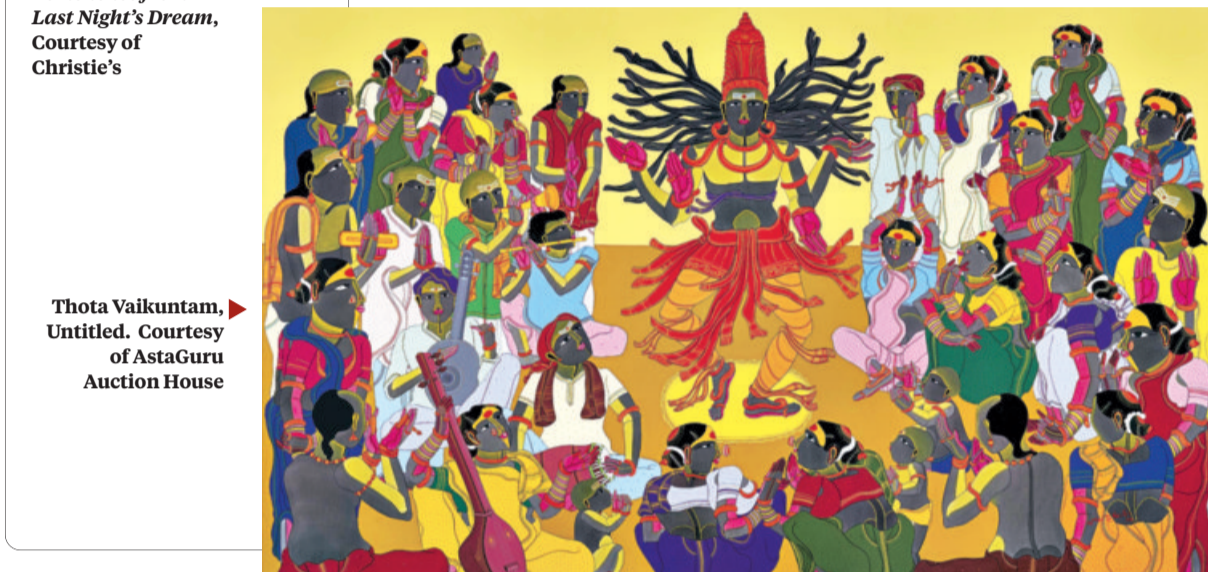
Thota Vaikuntam, Untitled .