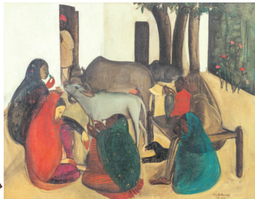
Amrita Sher-Gil, The Story Teller , 1937; sold for ₹61.8 crore, making it the highest-priced Indian artwork.