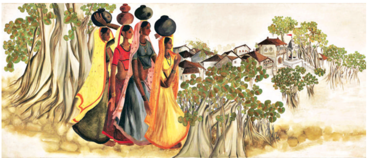
B Prabha, Untitled .