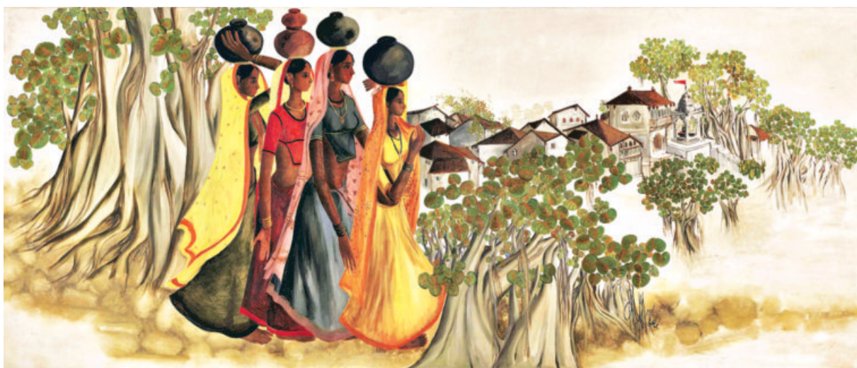
B Prabha, Untitled . Courtesy of AstaGuru Auction House