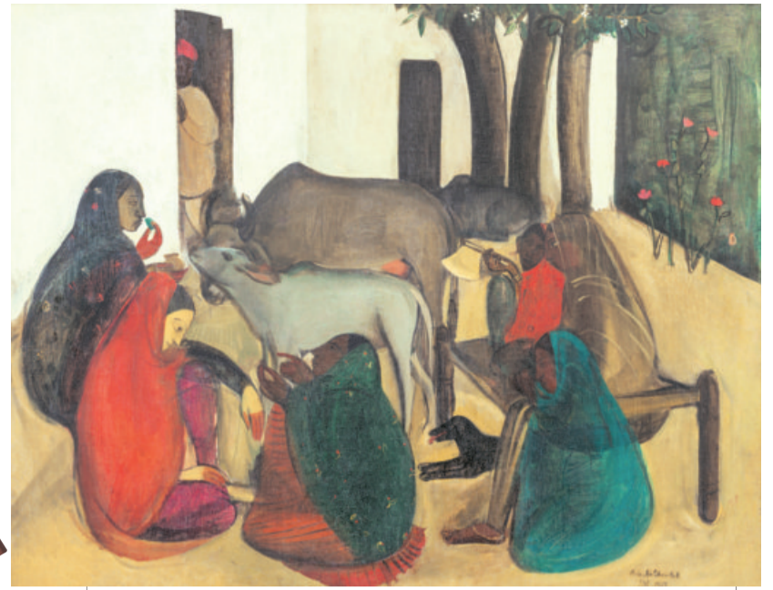
Amrita Sher-Gil, The Story Teller , 1937; sold for ₹61.8 crore, making it the highest-priced Indian artwork.