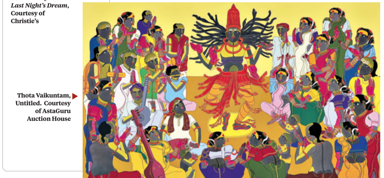
Thota Vaikuntam, Untitled .