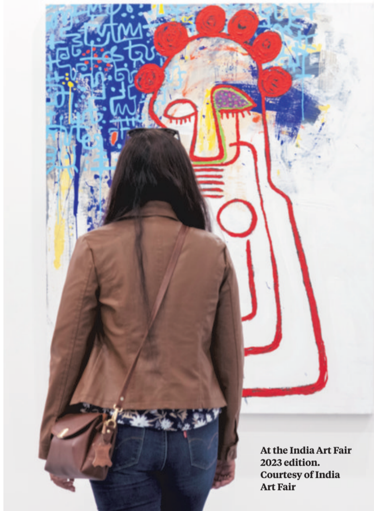
At the India Art Fair 2023 edition.

Come November and the city will also host its first major art fair, Art Mumbai,