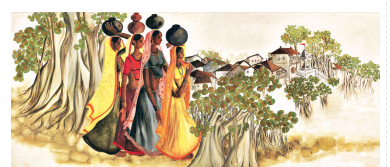
B Prabha, Untitled.